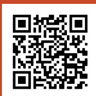
Training & Events Calendar