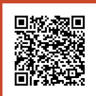
Product & Resources Catalog

Visit our website to access our FREE school mental health resources and trainings!