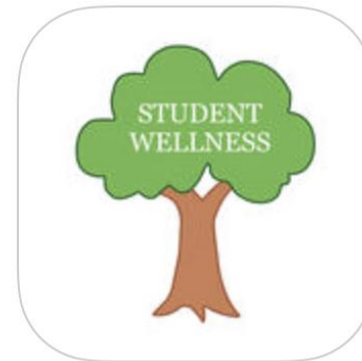
Student Wellness App