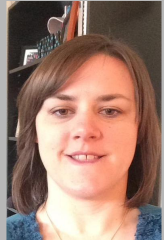
Community Based Services Coordinator