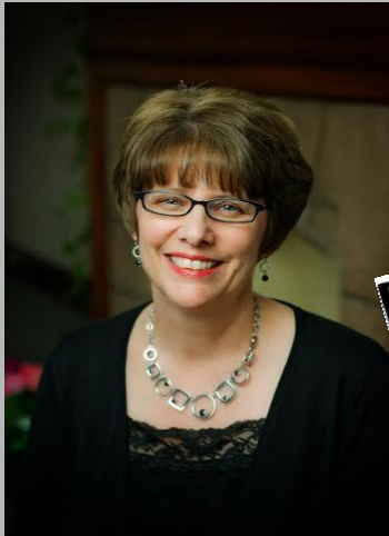
Executive Director of Elementary Ed.