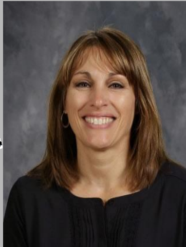
Walnut Elementary- Principal